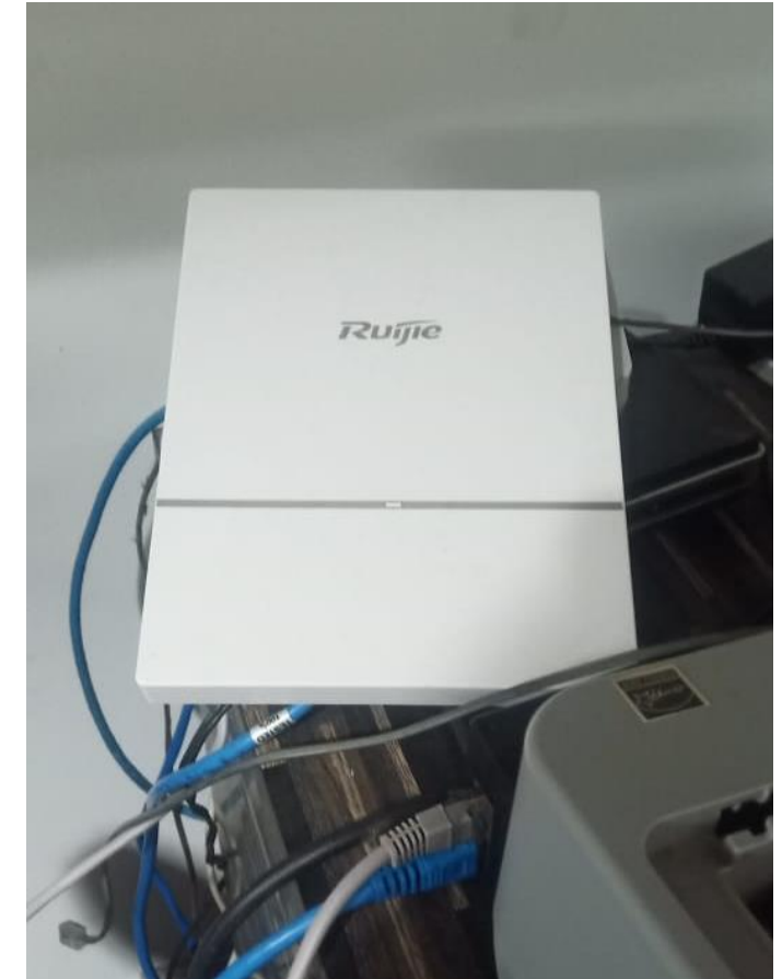
Block A Office