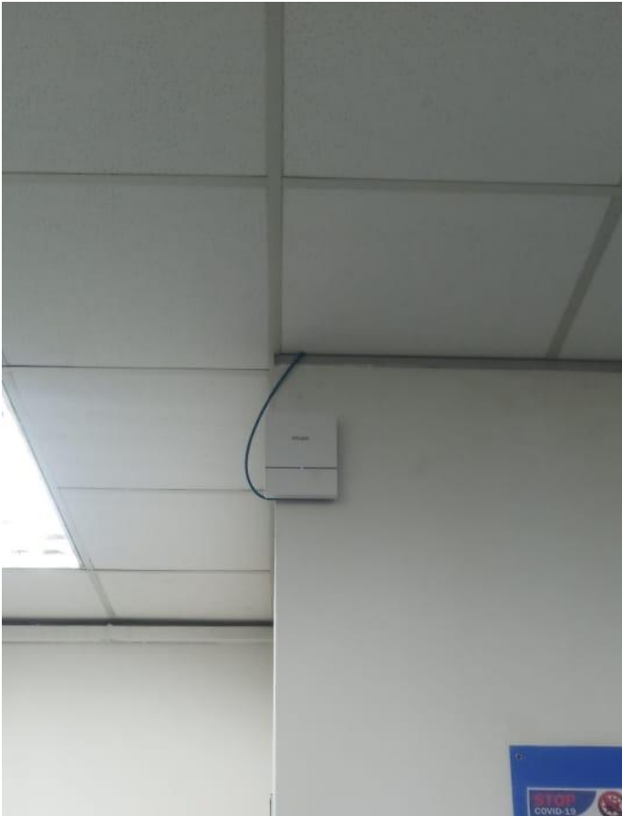
Block B Office