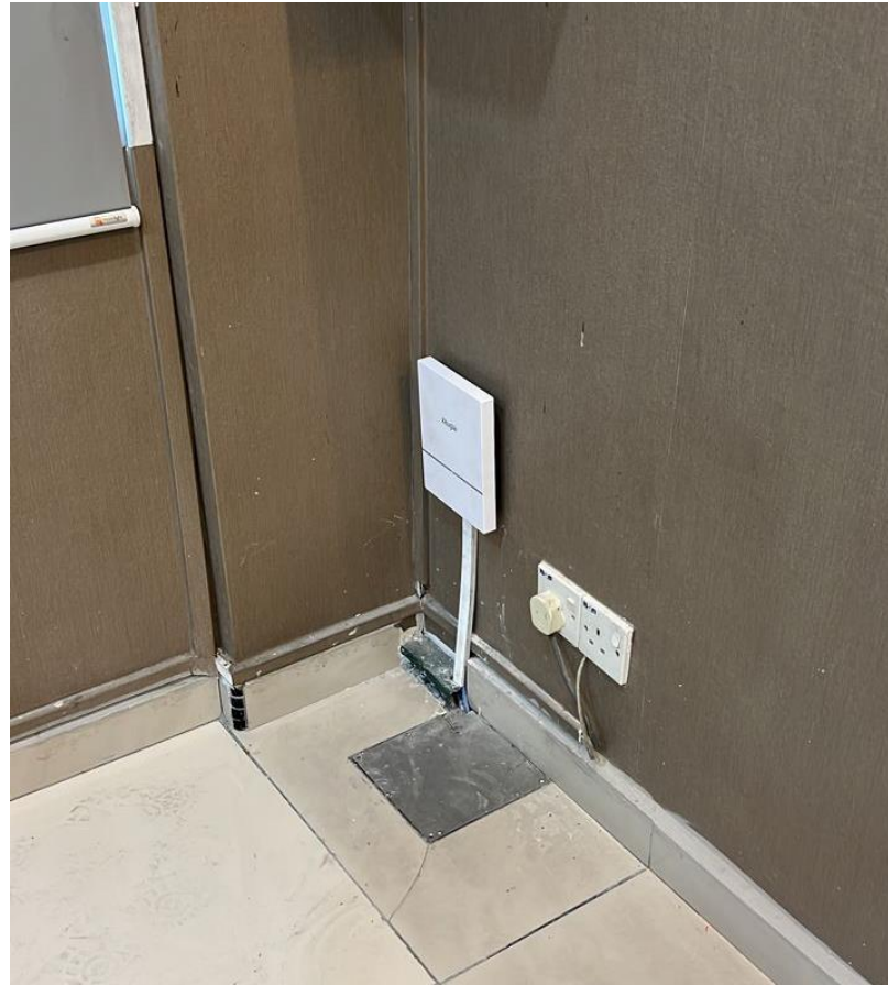
Block B Meeting Room